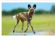
African wild dog

Animals can be sorted by whether they are wild or domestic. Different species of dog can be found in the wild and in the home as a domestic pet.