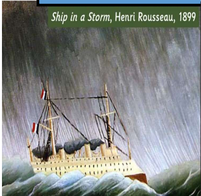
Ship in a Storm, Henri Rousseau, 1899