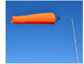
A wind sock is used to identify wind direction and force.