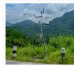
An anemometer is used to measure wind speed.