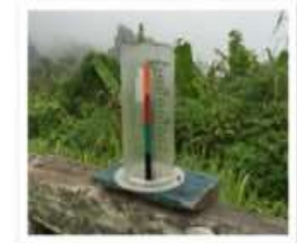
A rain gauge is used to measure the amount of rainfall.