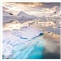
Antarctica is far away from the equator and has a cold climate.

Weather and climate mean different things. Weather is rain, sun or snow and it is changing all the time. Climate is the pattern of weather over a longer time. There are differences in the climate between continents across the world.