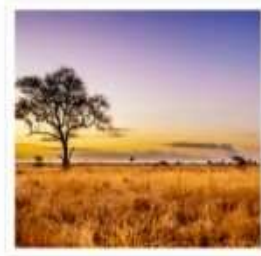
Africa is close to the equator and has a hot climate.