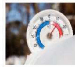
A thermometer is used to measure the temperature.

Weather can be measured using simple equipment.